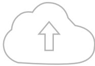
ABELDent CS Cloud Server Solution

Grow. Protect. Prosper. At Every Stage of Your Practice