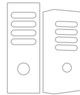
ABELDent LS & LS+ Local Server Solutions